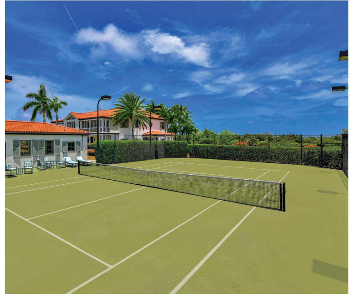
The grounds of the estate are beautifully appointed with a private all-weather lit tennis court and a stunning pool situated perpendicular to the expansive horizon.